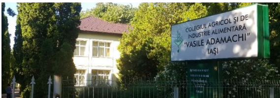
(The main building of the college)

“Vasile Adamachi” Agricultural High-school is situated in the north-east region of the city of Iasi (the capital of the Iasi county), on one of the most beautiful hills, Copou.