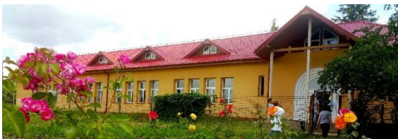
(The third building of the college)

High-school - with the following specializations: Ecological agriculture, Food industry, Economics– financial and commercial activities, Commerce, Environmental protection, Banqueting and event planner