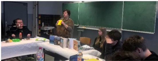
(meeting with an author of cookbook)