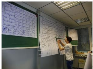
(brainstorming: product development)